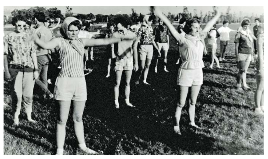
Early Morning Exercises—The Girls Go Through Their Paces.

the men's dorms. We used our A whizz was a beautiful word I mean, what was Fanny doing waste paper bins and sometimes which covered a HUGE range of wandering around at four in the activities between a bloke and a morning? Fortunately we didn't girl. Basically if you asked a girl get sprung...on that occasion. We also played jerks where you to the pictures or maybe even out arm against the wall and try and whizz. Well, I classed it as a assembly - compulsory assembly. methods and rules. Broom throw- asked you who you were whizz- caught. I recall putting on a pair