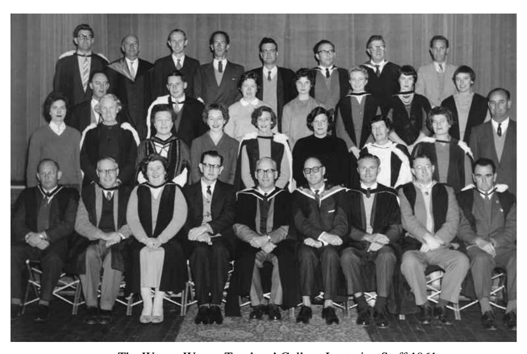
The Wagga Wagga Teachers' College Lecturing Staff 1961