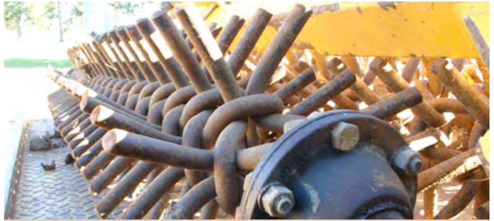
Prickle chains are used behind sowing equipment to assist seed covering and levelling of the soil surface.

stubble. While disc machinery handles heavier stubble loads and disturbs the soil less, they can result in 'hair pinning' (that is, stubble is bent rather than cut and pushed into the sowing groove with the seed), which reduces seed/soil contact. Other equipment combinations including press wheels, coulter discs, trailing harrows,