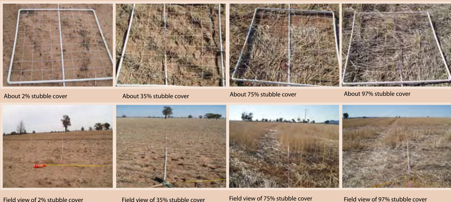
About 2% stubble cover

Inter-row sowing allows crops to be sown into standing stubble and relatively high stubble loads without needing to chop, spread or burn stubble. Figure 3 shows various stubble management options.