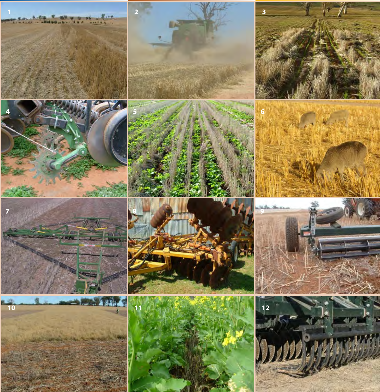
Figure 3. Stubble management options.