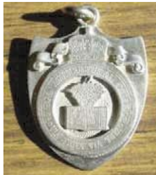
Ladies WACOBU Shield Pendant $65.00