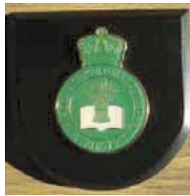
WACOBU Wall Plaque - $30.00