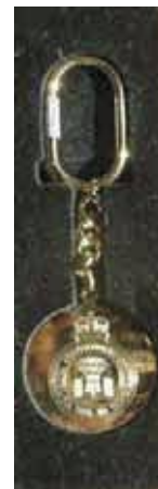
WACOBU Keyring $15.00