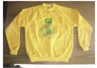
WACOBU Sloppy-joe Price - TBA