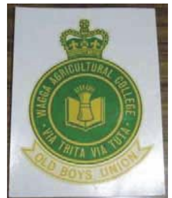
WACOBU Car sticker $1.00