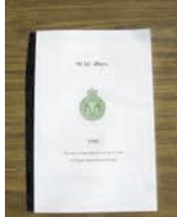
WAC 49er's Book POA