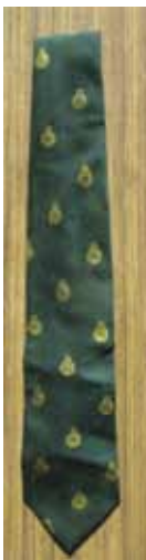
WACOBU Tie $30.00