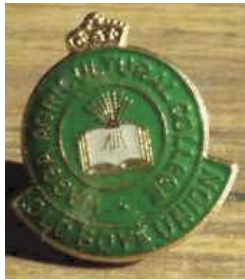
WACOBU Lapel Badge - $2.00