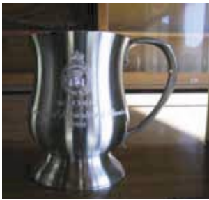
WACOBU Pewter Mug - $50.00