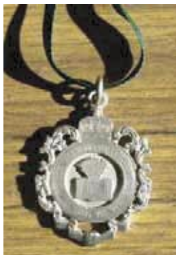
Ladies WACOBU Pendant $6.50