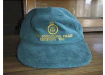
WACOBU Centenary Cap - $12.00