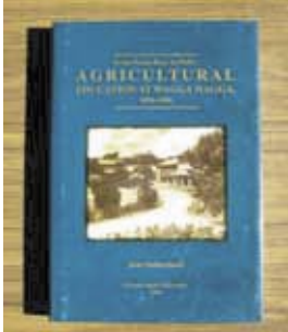
From Farm Boys to PhDs Book - $30.00

Post order from to PO Box 1092 Wagga Wagga 2650