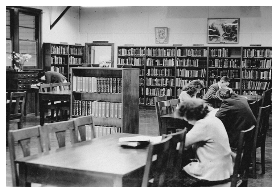
The Wagga Wagga Teachers College Library 1950