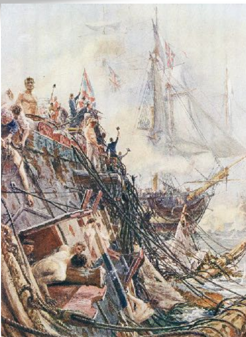
"HMS Belleisle" after Trafalgar

Pray write to our Father, for although I have wrote I do not know too certainly where he is, I fear it will be a long time reaching him.