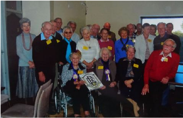
- The assembled group at Southern group reunion

school library and teaching history to high school levels 1 and 2; a very varied teaching experience!