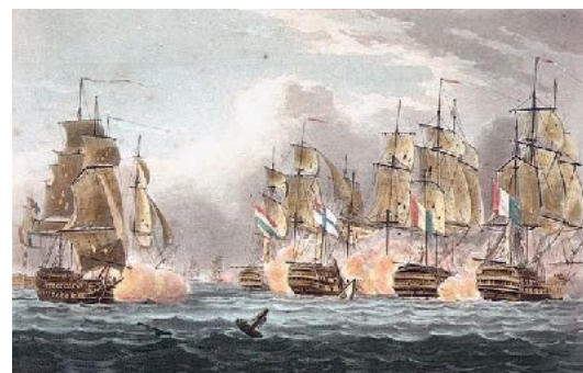
Some painted scenes from the Battle of Trafalgar 1805