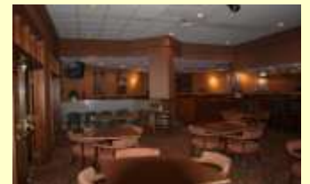
Left: Bar and restaurant in the Holiday Inn being converted into student social study space.

I was amazed at the University's decision to buy a 400 room Holiday Inn hotel next door to the Uni and convert to a residence hall to meet a higher level of student demand for this year. An amazing work schedule to achieve a very quick turnaround. The time period from decision to buy to open was weeks. www.youtube.com/watch?v=xsp1qoEup2c - Related videos).