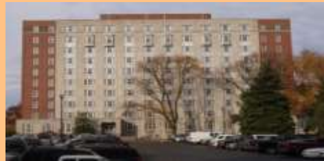
Left: One block of eleven residential halls, 1000 students reside in each block.

The conference was attended by about 300 university staff from around the world. Whilst the conference had a residential living focus, I gained valuable insight of the development of living/learning programs and general trends in residential and general university developments in on campus student communities. There were several sessions I attended that looked at the strong links with student on campus living and student engagement with the university.