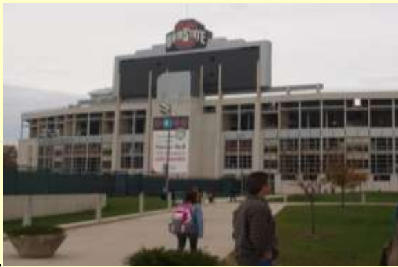
Left: Ohio State Football Stadium - The pride and joy of the University. The stadium seats 105,000!