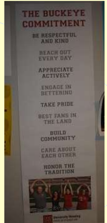
A value statement operating for 2010, promoted by Student Services