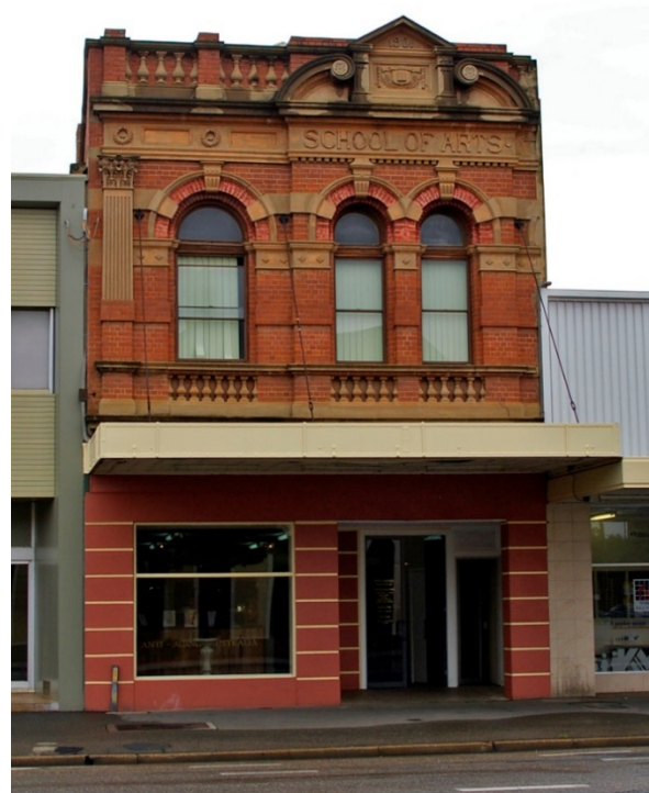
School of Arts building as we know it today