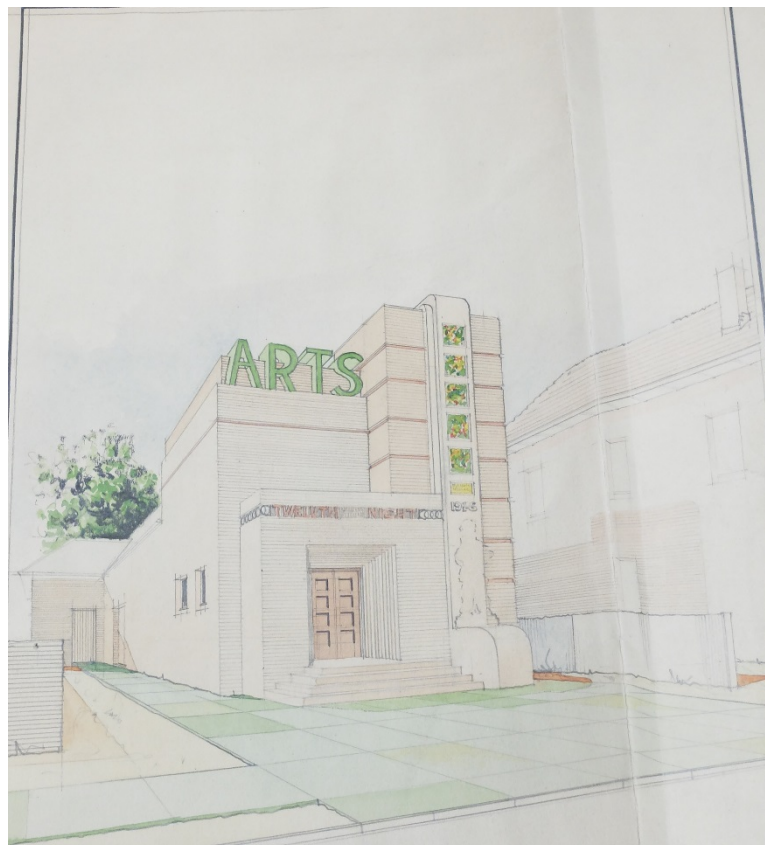
RW3170/83. Specifications and Conditions of Contract: Proposed Theatrette - S.J. O'Halloran. c.1946