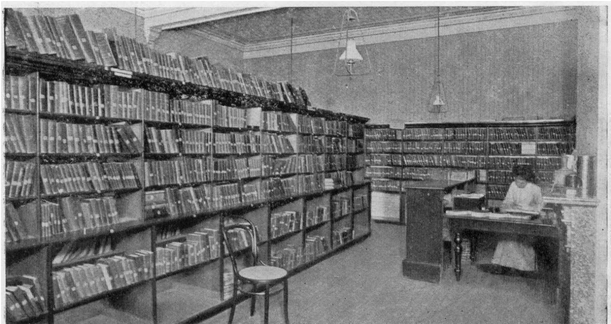
Portion of Library, School of Arts.

In addition to the introduction of the Drama Festival, the School of Arts' major feats include the continual presentation of performances since 1945, with the countless success of their productions documented in the historical pages of their archival collection, but also in its contribution to Wagga Wagga's cultural platforms as we know them today. As 1946 brought about the transfer of the School of Arts library assets to the Wagga Wagga City Council who effectively assumed the role of public library operations, the finalisation of a major historical agreement between the School of Arts and the Wagga Wagga City Council came about in 1959. Effectively contributing to one third of the cost, it was resolved that the Institute would sell their historical premises and commit the funds from the sale to the construction of the Wagga Wagga Civic Theatre, the cultural hub of the town. Though stormy negotiations and out-cry are well documented in the collection, it is in the Civic Theatre's success and the School of Arts' permanent home located in the Basement Theatre of the Civic Theatre that we are able to recognise their ability to adapt and endure for the good of cultural engagement.