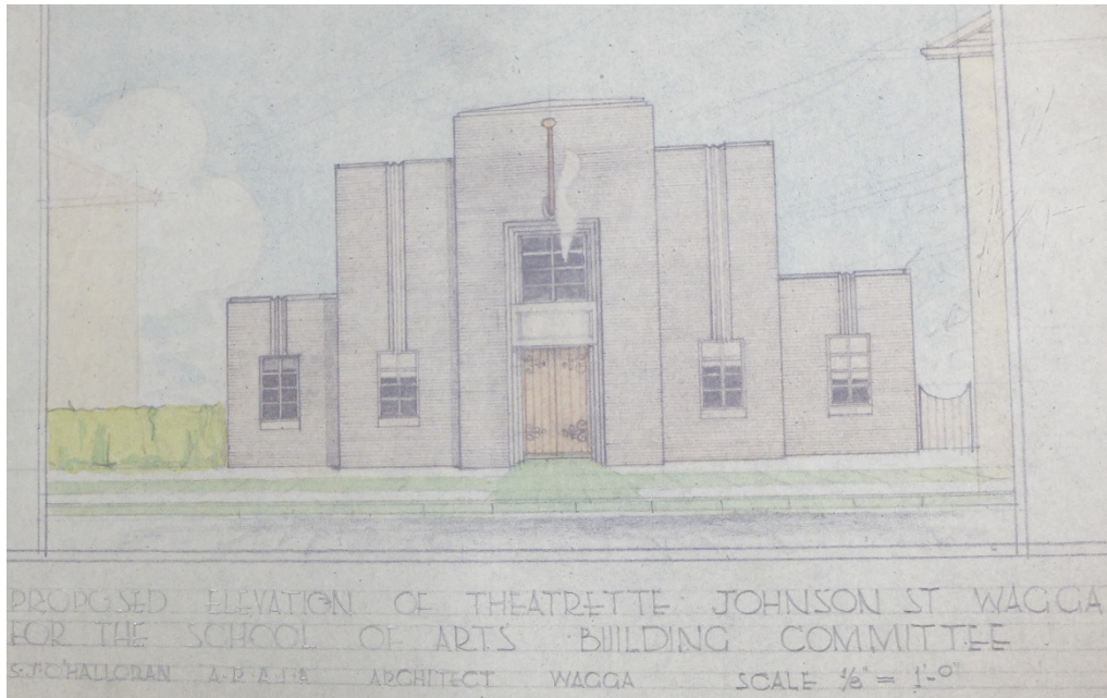
RW3170/82. Specifications and Conditions of Contract: Proposed Theatrette - S.J. O'Halloran. c.1946