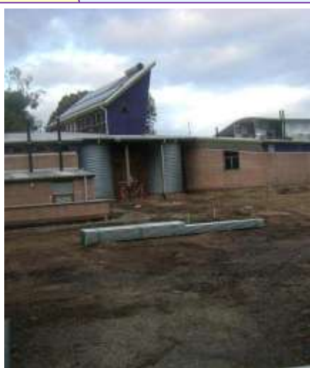
Construction is starting on the Gums "G" Bar project at Thurgoona