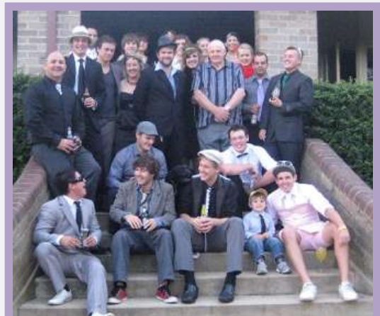
Bathurst RA's in roaring 20's outfits for a Meals on Wheels fundraiser