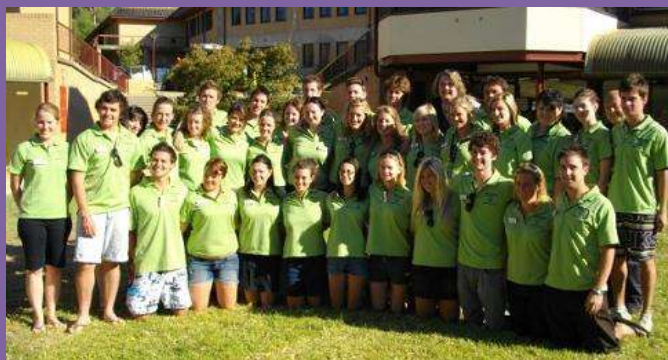
2010 Wagga RA's in Orientation Week