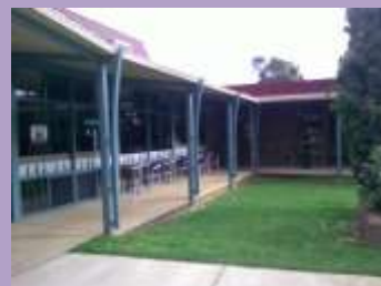
The New Greasy Spoon Wagga Wagga