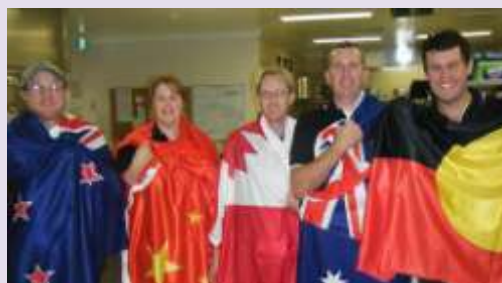
Bathurst Catering getting into footy fever for the world cup

Overall we have had a busy couple of months and it looks like being the same in the coming few months. We have a large number of staff who are currently studying. Food Service staff are in the process of completing Certificate 2 Hospitality Operations to further their skills and knowledge, kitchen hands have been busy acquiring forklift tickets to assist them in their roles, administration staff are undertaking studies in Business Administration Certificate 4 and a couple of us are participating in the Frontline Management course.