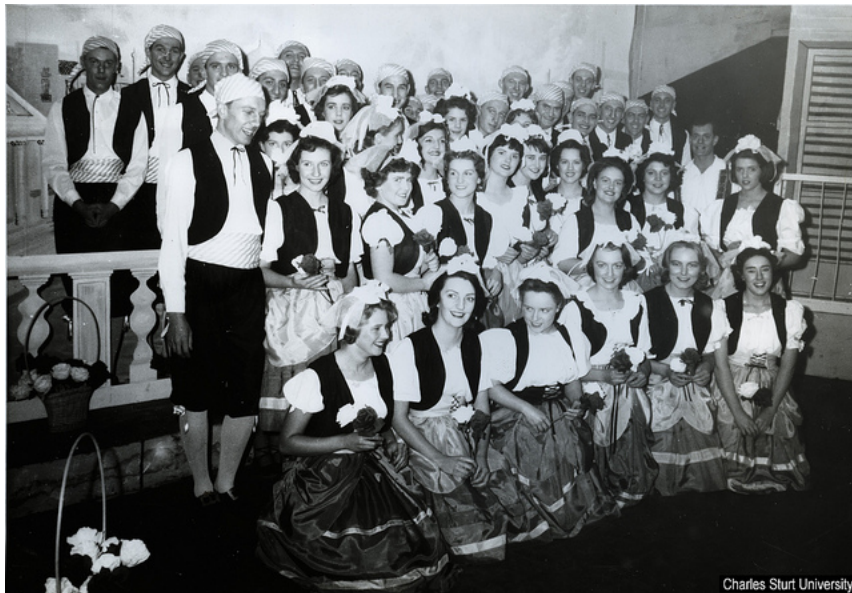
The Cast of "The Gondoliers" - The Wagga Wagga Teachers' College 1963)