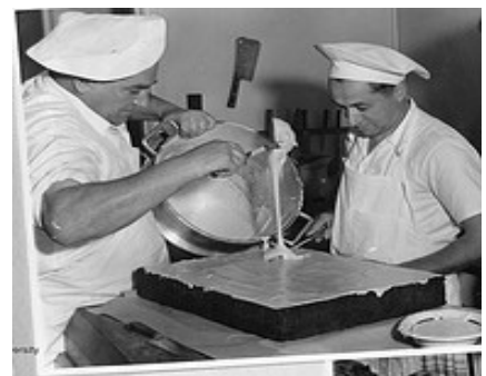
Making a Cake 1957

Quite suddenly this information session with personal discussions with our Second Year Dorm Housemates was interrupted with the appearance of the "Senior Swimming Lecturer" (in reality an older second year student posing as a lecturer) who managed to convince most of the newly arrived that he was the real thing! He required all new students (with a lot of support from the Second Year Gang) to meet him at the Town Swimming Pool at 6am the next morning!