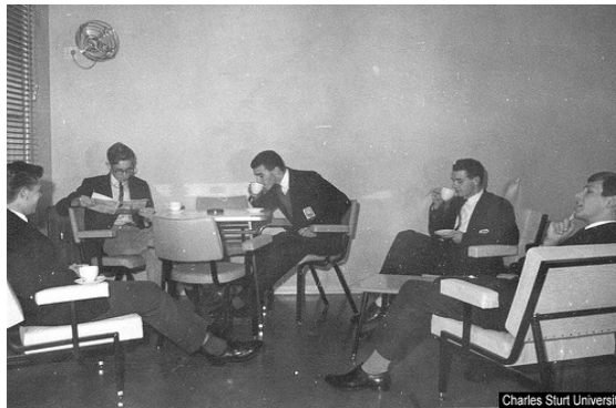
Male Dormitory 1961

A new friend, who later was our Best Man at our Wedding in 1960, already knew many of the students, and kindly arranged to