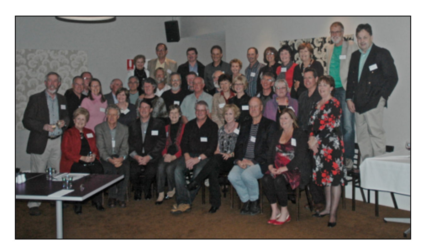
Celebrating a Fortieth Reunion in Bathurst

Southern Queensland and later western NSW, me as Tutor and he as Angel.