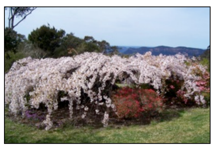
Looking towards Mt Solitary at the BTCAA Open Garden