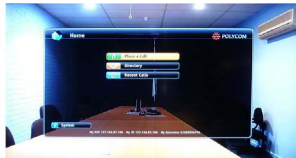
Figure 2 (HD V/C screen display)

If there is no picture check the system/screen is turned on. If there is a blue screen check the correct input is selected on the TV (eg usually AV 1, press the AV button on the TV remote to change)