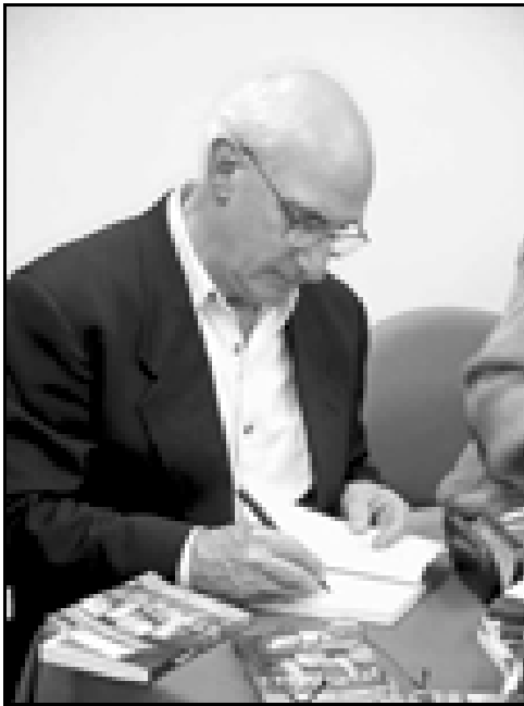
David Malouf at the reading in April