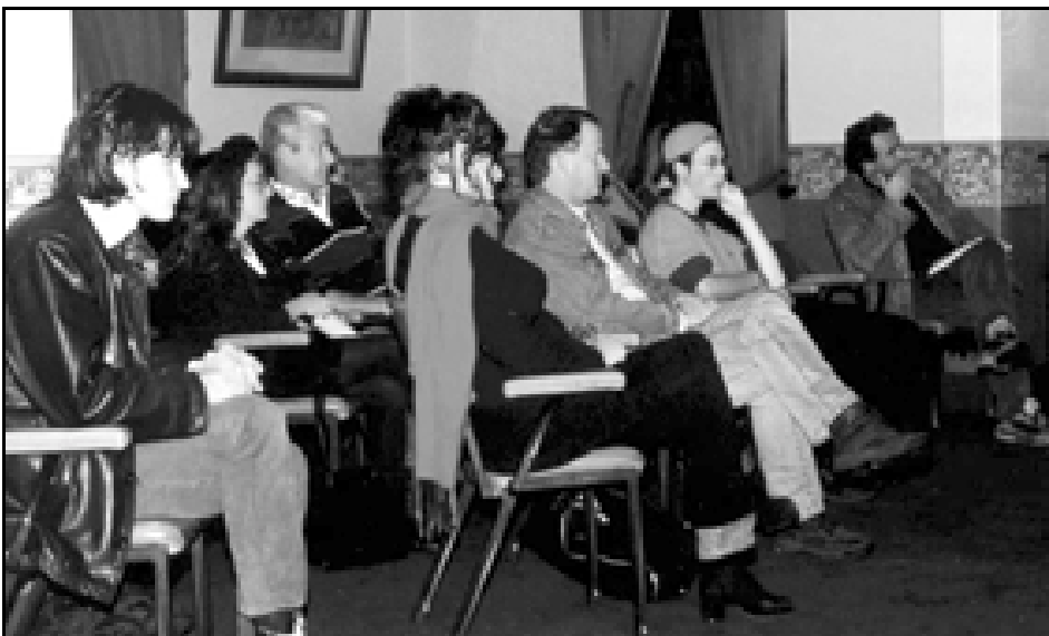
Members and friends enjoy the Crane reading in Wagga Wagga