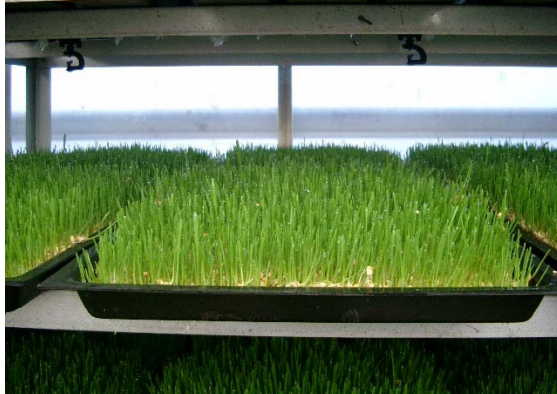
Plate 1. Eight-day green fodder for a combination of selected cereals

Examples of tables, plates and figures are inserted within these instructions to authors.