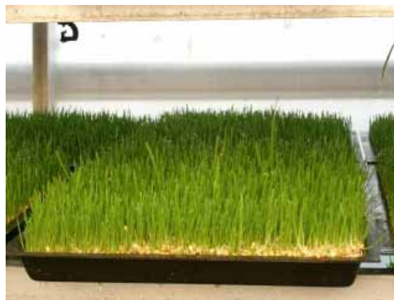
Plate 1. Eight-day green fodder for a combination of selected cereals

Examples of tables, plates and figures are inserted within these instructions to authors.