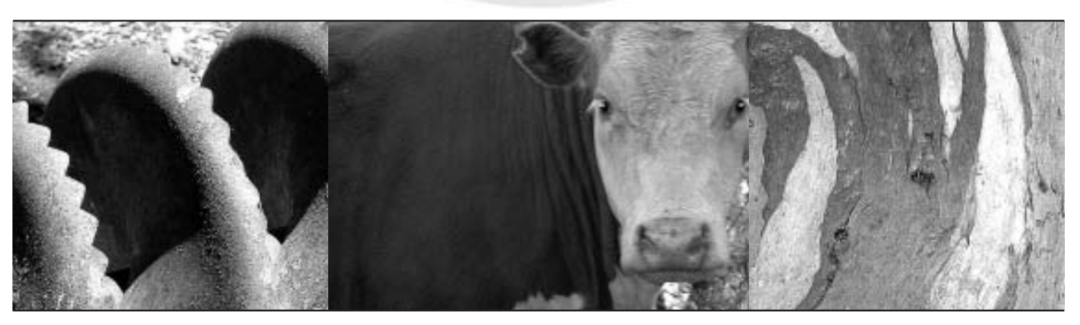
WACOBU now available on line - www.csu.edu.au/division/alumni

Reunion Weekend - Saturday 18 October 2003 WACOBU - AGM - 11am in the MTC Meeting Rooms followed by Ag College Race Day at 12pm