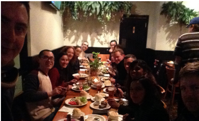
FGC Canberra Retreat Saturday night dinner

After a few presentations on their research projects in exotic areas of the globe, we were treated to a scrumptious lunch where more members of ACIAR joined and mingled with us. The session finished with a discussion of our group's function. They showed interest in our projects and asked many questions. After a few group photos we departed and