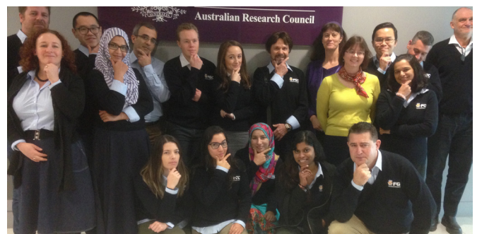
FGC Canberra Retreat

A final visit to CSIRO Plant Industries covered aspects of plant-based genetic research and how it is tied in with marketing outcomes. In all, this was a valuable training