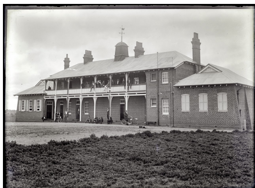
The Heffron Building

-- (This article and associated photos will be continued in next year's Panorama)